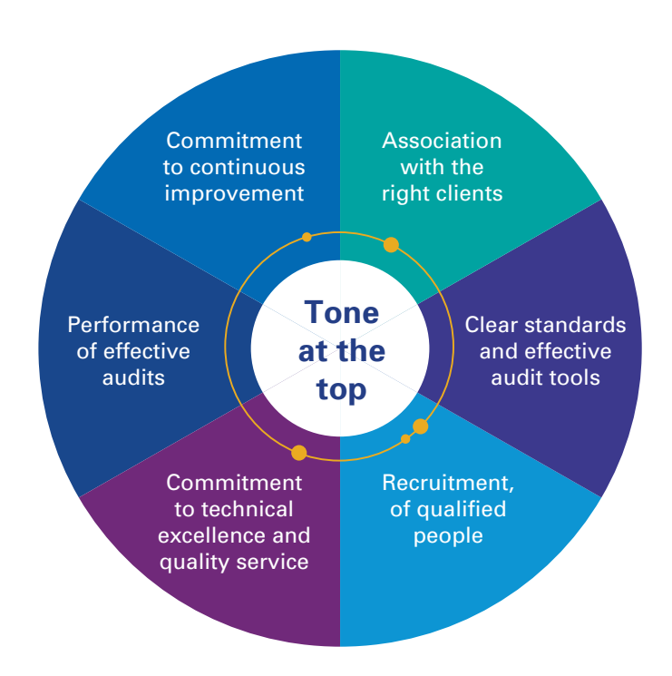
Our Global Audit Quality Framework

Tone at the top is fundamental to the core of the Global Audit Quality Framework's seven drivers, and as a driver itself, guides the right behaviors across the firm. All of the other drivers are presented within a continuous circle because each driver is intended to reinforce the others. Tone at the top is discussed at the beginning of this report, and the other six drivers are described in more detail in the following sections of this report.