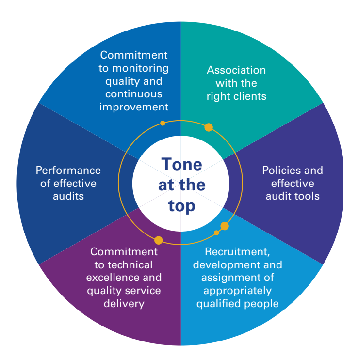
Our Global Audit Quality Framework

Tone at the top is fundamental to the core of the Global Audit Quality Framework's seven drivers, and as a driver itself, guides the right behaviors across the firm. All of the other drivers are presented within a continuous circle because each driver is intended to reinforce the others.