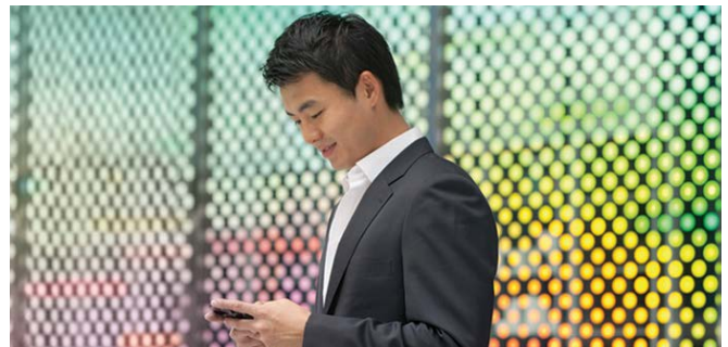
IFRS 15 for sectors