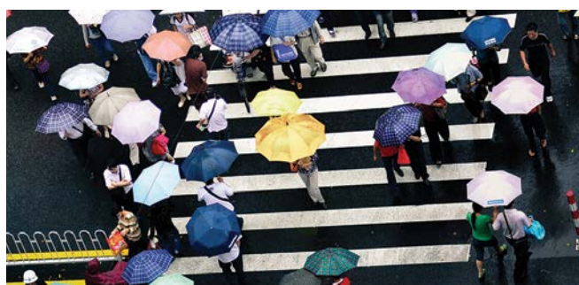
Insurance contracts (under development)