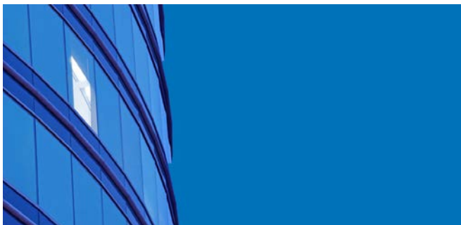
IFRS for banks