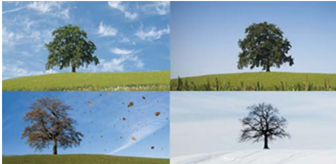
Newly effective standards