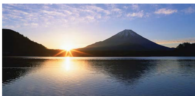
Presentation and disclosures