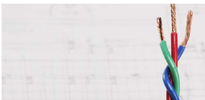
Business combinations and consolidation